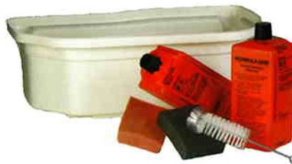
Peri-Pro Cleaning Kit

Used for quarterly cleaning of Peri-Pro Transports to reduce staining, decrease normal maintenance time and prolong the life of your Peri-Pro. Peri-Pro Transport Cleaning Kit is an easy and convenient way to care for your Peri-Pro. It is specially designed to hold the transport with just the right amount of Formula 2000 and water. The tub is completely self-contained, portable and requires little counter space. The deep cleaning with Peri-Pro Transport Cleaning Kit takes only 30 minutes.